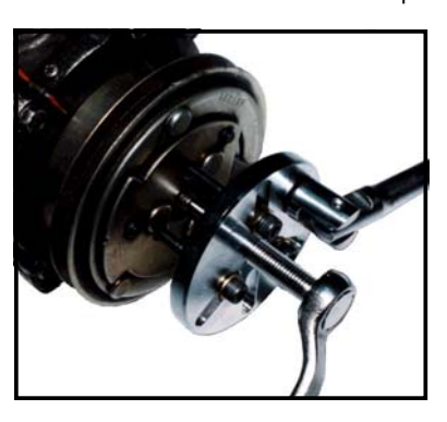
Removing the 3-tap type clutch