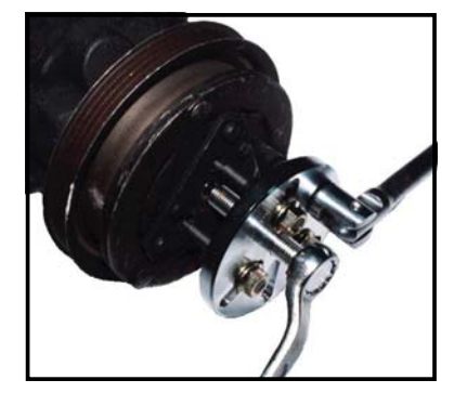
Removing the 3-hole type without tap (Zxcel)